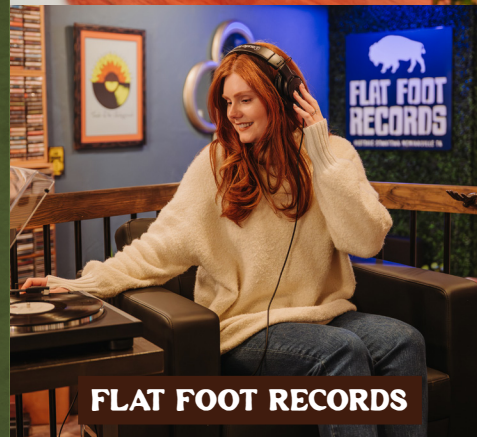
FLAT FOOT RECORDS