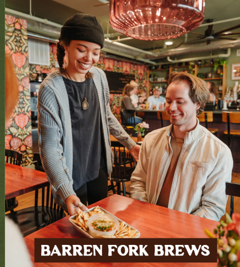
BARREN FORK BREWS