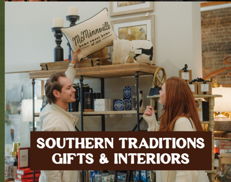
SOUTHERN TRADITIONS GIFTS & INTERIORS