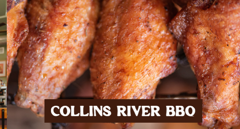
COLLINS RIVER BBQ