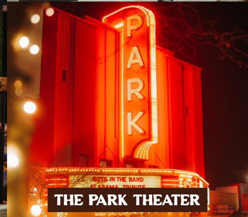
THE PARK THEATER